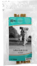
Buffalo Bully Sticks