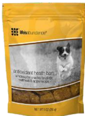
Antioxidant Health Bars