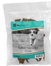
Buffalo Meat Strips