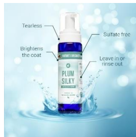
Nature's Specialties Waterless Shampoo Foamer