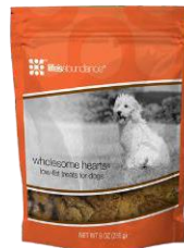
Wholesome Hearts Low-Fat Treats for Overweight Dogs