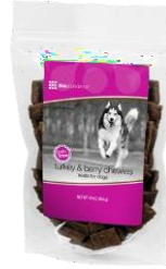
Grain Free Turkey & Berry Chewies