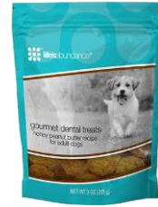
Gourmet Dental Treats