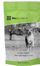
Turkey Hearts Freeze-Dried Treats