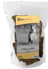
Buffalo Lung Fillets